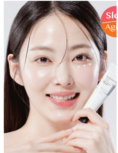
[COSRX] The Retinol 0.1 Cream 20ML Korean Skincare