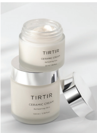
[TirTir] Ceramic Cream 50ml, 100ml Korean Skincare