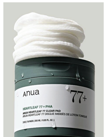
[ANUA] Heartleaf 77 Clear Pad Korean Skincare