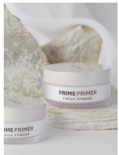
[Banila Co] Prime Primer Finish Powder 12g Korean Cosmetic