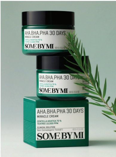
[Some By Mi] AHA BHA PHA 30 Days Miracle Cream 30g Korean Skincare