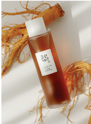
[Beauty of Joseon] Gingseng Essence Water 150ml Korean Skincare