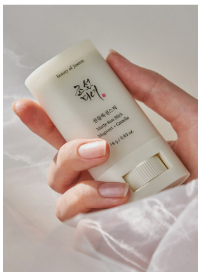
[Beauty of Joseon] Matte Sunstick: Mugwort + Camelia 18g Korean Skincare