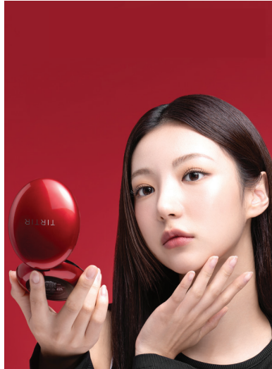
[TirTir] Mask Fit Red Cushion Foundation 18g Korean Cosmetic