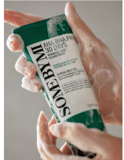
[Some By Mi] Miracle Acne Clear Foam 100ml Korean Skincare