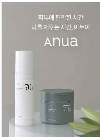
[ANUA] Heartleaf 70 Daily Lotion Korean Skincare