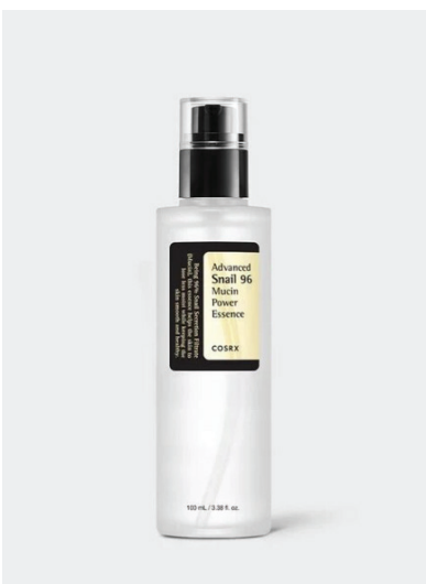
[COSRX] Advanced Snail 92 Mucin Power Essence 100ML Korean Skincare